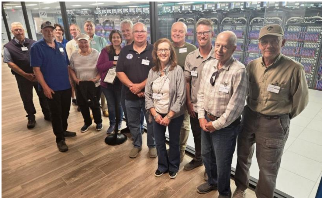
Photo of the Month Our Group at Argonne National Laboratory In Front of the New Aurora Exascale Supercomputer