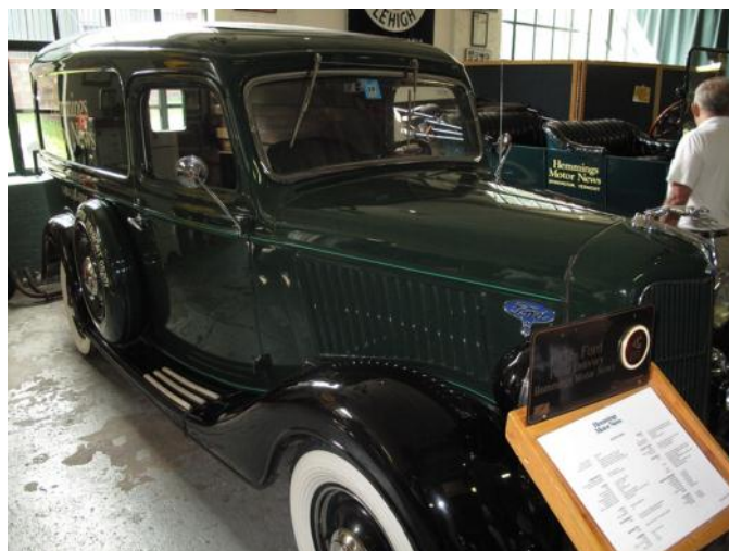
1936 Ford Panel Delivery at Hemmings Motor News