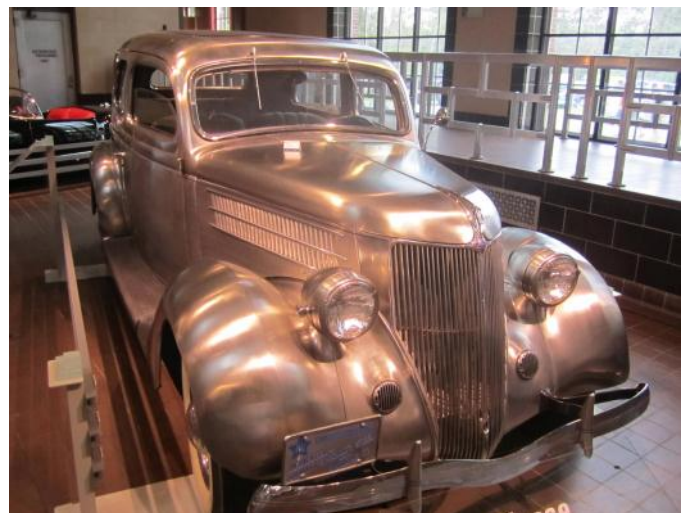
Stainless Steel '36 Sedan at Saratoga Auto Museum