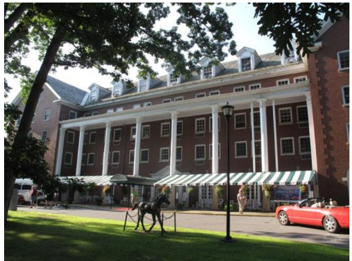
Our destination - the Gideon Putnam Hotel

Back on the road for day two, we hit the New York Thruway flying, but noticed the miss was becoming more frequent. With 676 miles down and about 190 left to the hotel, I decided to check under the hood at the next gas stop. Nothing seemed amiss, so we prepared to gas up and get back on the road. But the starter just spun – something had happened to the Bendix. We pushed the Ford to start it, but as soon as we got on the road the miss was now constant and we needed to address it. At the next service area as I changed the coil and condenser I looked up and saw familiar faces. V-8ers Frank & Millie Scheidt in their '40 Sedan and Bruce Nelson & Mary Hyberg had just happened to stop at the same travel plaza on their way to Saratoga Springs. I placed a call to V-8er Dick Spadaro in Altamont, NY, who had made the generous offer to use his garage if anyone going to the meet had a problem. Dick gave us great directions to his place in the wilderness and with another push from Joe, Carolyn, and Bruce, we were back on the road. There was also good news; the miss was gone.