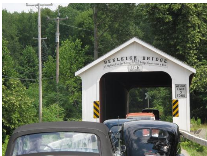
A line of V-8s crosses a bridge