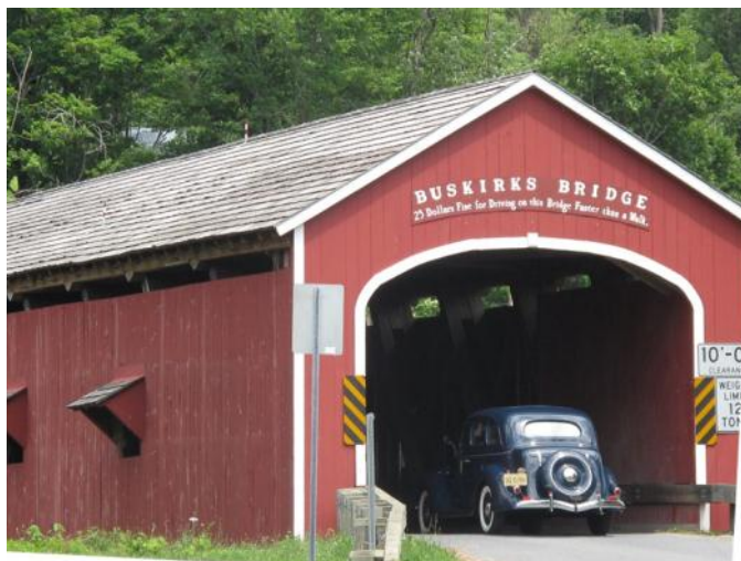
One of the many bridges we crossed

Wednesday was concourse day; a very busy day for everyone. Carolyn and I attended the judges' breakfast as Carolyn is responsible for tabulating the voting for Touring vehicles. Meanwhile Joe was